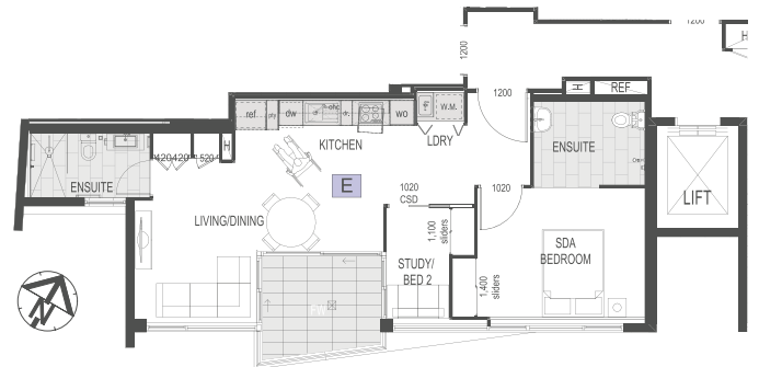
FLOOR PLAN - TYPE E

The floor plan is an example of one of the apartments.